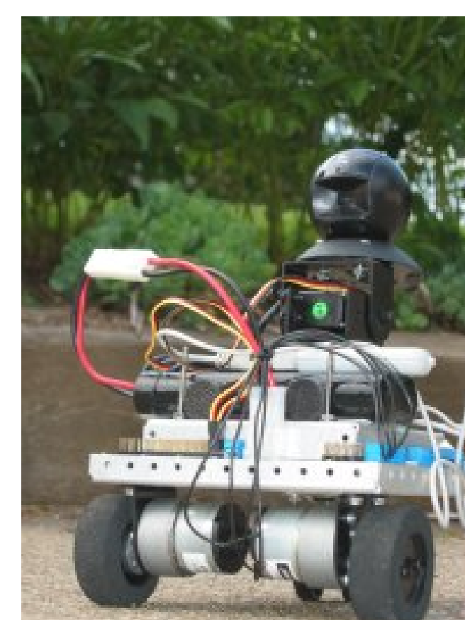
Qwerkbot+ (TeRK project; Nourbakhsh et al., CMU)