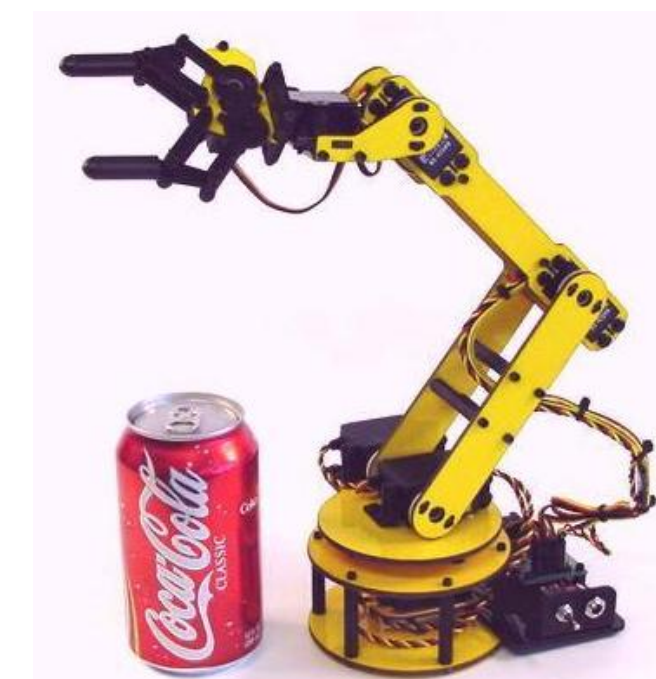
Lynx Motion 6-dof arm